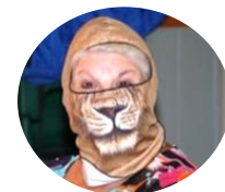
Who is our visitor?

October 18 – Board Meeting, Kountry Kitchen, 6:00 pm