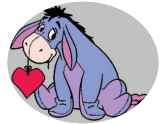
Happy Valentine's Day!

Month – American Heart month ; Black History month; Chocolate month