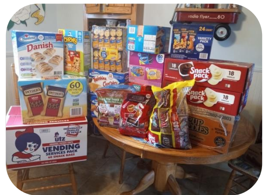
Donations received at the Christmas Extravaganza for Heroes Ridge.