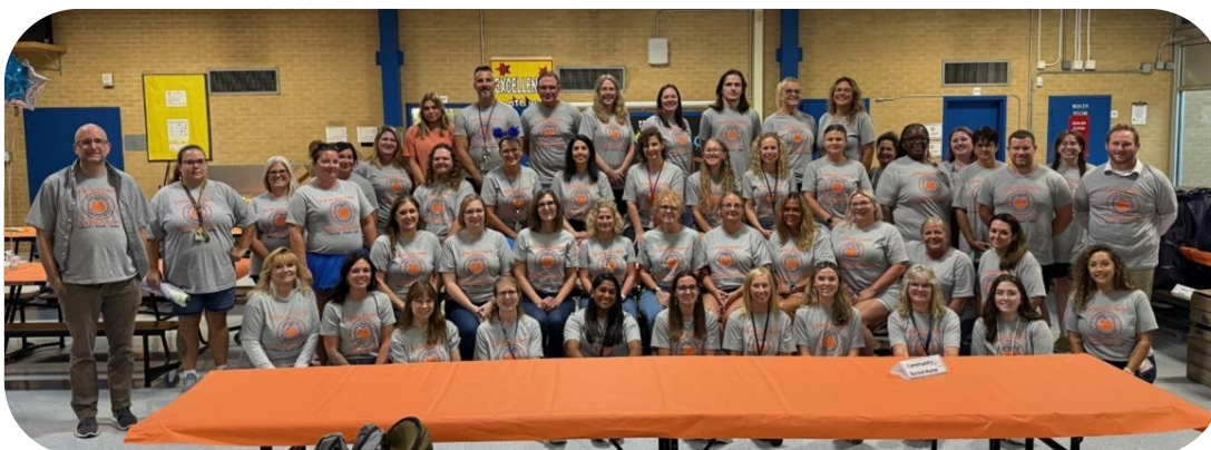
← Lewistown Elementary School staff wearing their designed t-shirts